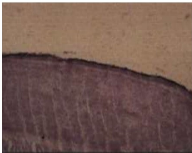
Fig. 3. The structure of an echinococcal cyst of the modification Echinococcus acephalocystis .

(hemotoxylin-eosin stain, magnification x 200).